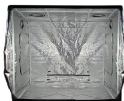
PULL TENT SKIN OVER FRAME AND ZIP UP SIDES