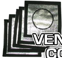
VENT PORT COVERS