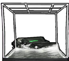
UNZIP TENT SKIN AND SET FRAME INTO BOTTOM OF TENT SKIN

* PLEASE BE PATIENT AND GENTLE WHEN PULLING SKIN OVER TENT FRAME TO AVOID TEARING SEAMS