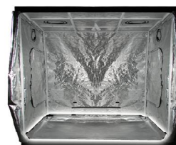
LAY TENT FLOOR LINER IN PLACE AND TIE TO TENT CORNERS