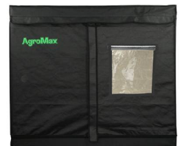
ZIP UP DOOR PANELS. YOUR TENT IS NOW READY FOR LIGHTING, VENTILATION AND PLANTS