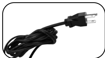
6' POWER CORD